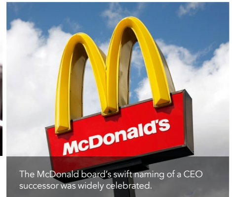
The McDonald board's swift naming of a CEO successor was widely celebrated.

So, in this element of the study, the research team hypothesised that