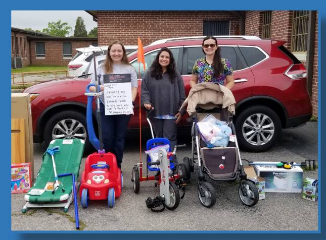
Therapists excited about finding equipment for pediatric patients at clinic.