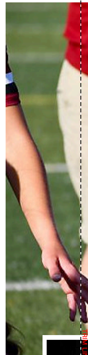
TRIM LINE TRIM LINE TRIM LINE

"It's not as easy as just getting on the field. I used to take that for granted but I haven't let it stop me."