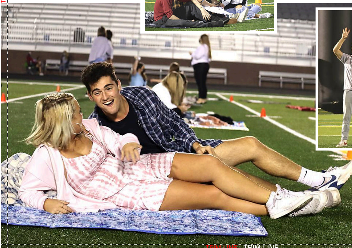
SHOW-TIME SPECIAL GUESTS: (above) Wando's Student Council surprised students that attended the movie night with the stars of Outer Banks . Movie goers were able to meet, talk to, and take photos with the cast while watching the film on the big screen. They told the students about the upcoming season of the show and what to expect.

Customer is allowed to have objects outside of the margin.