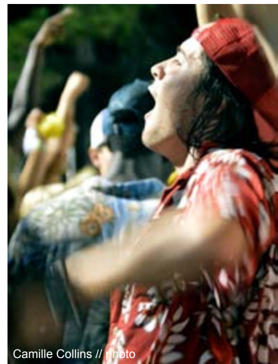
Camille Collins // photo