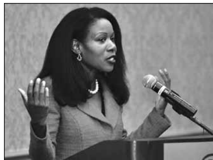
Isabel Wilkerson delivers the keynote address at the 2011 Symposium.