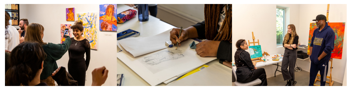
Ceramics | Drawing + Painting | Graphic Design | Photography | Printmaking | Sculpture

Housed in the largest academic art department in the state, Studio Art and Design provides students with a wide array of opportunities in studio concentrations of ceramics, drawing and painting, graphic design, photography, printmaking, and sculpture.