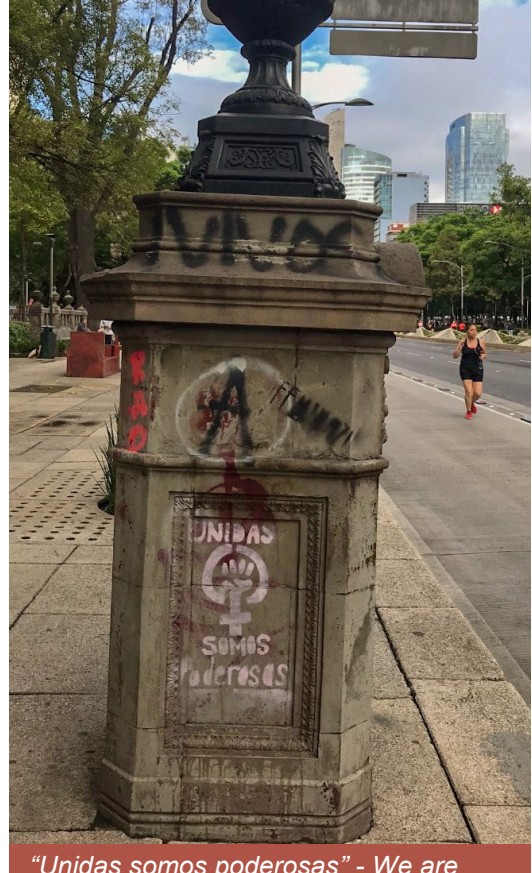
"Unidas somos poderosas" - We are Powerful United

A feminist message from the streets of Mexico City.