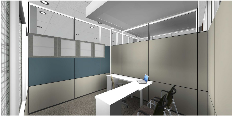
PH 026 – ResLife Coordinator Reconfiguration