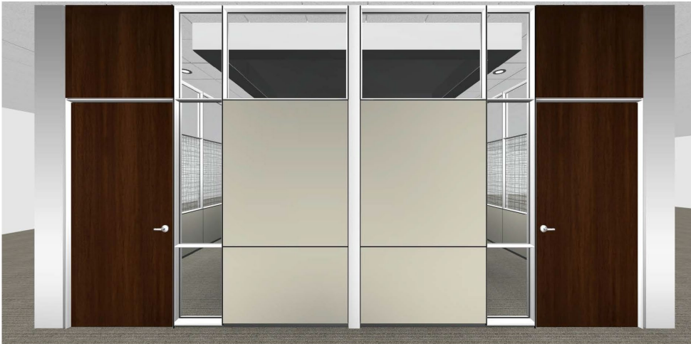
PH 026 – ResLife Coordinator Reconfiguration