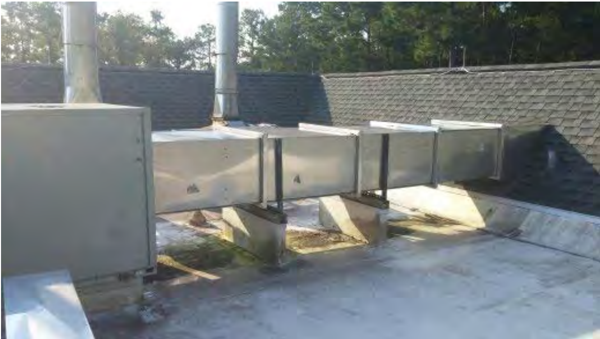
Existing return air and outside air duct to be removed