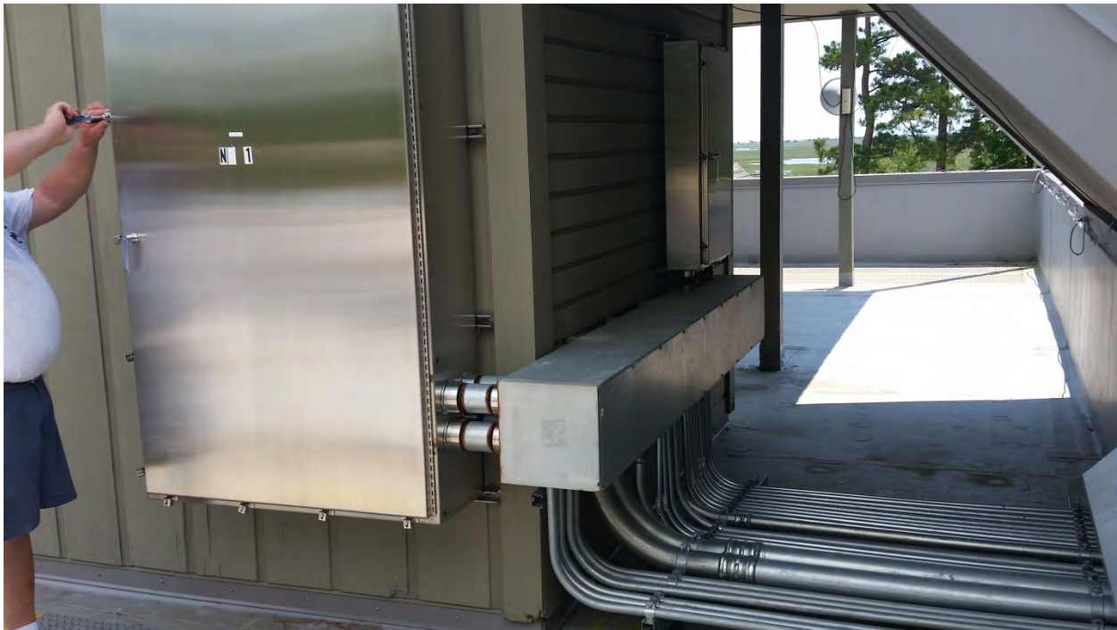
Location of exiting power panel board NH-1