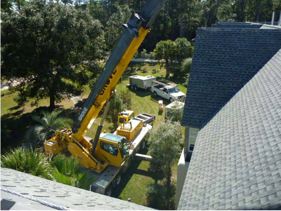
Recent photo showing previous crane removing and replacing HVAC Unit