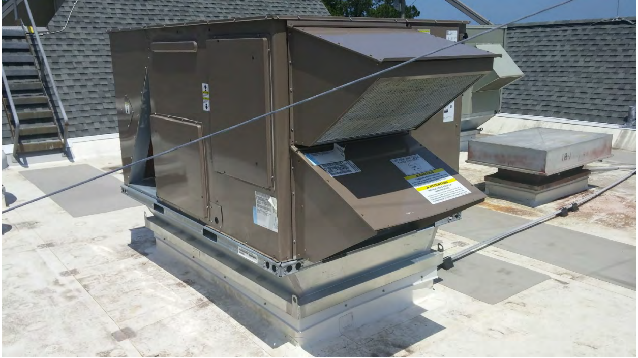
Existing AC-2 replaced previously (Scope of work included as Alternate # 2)