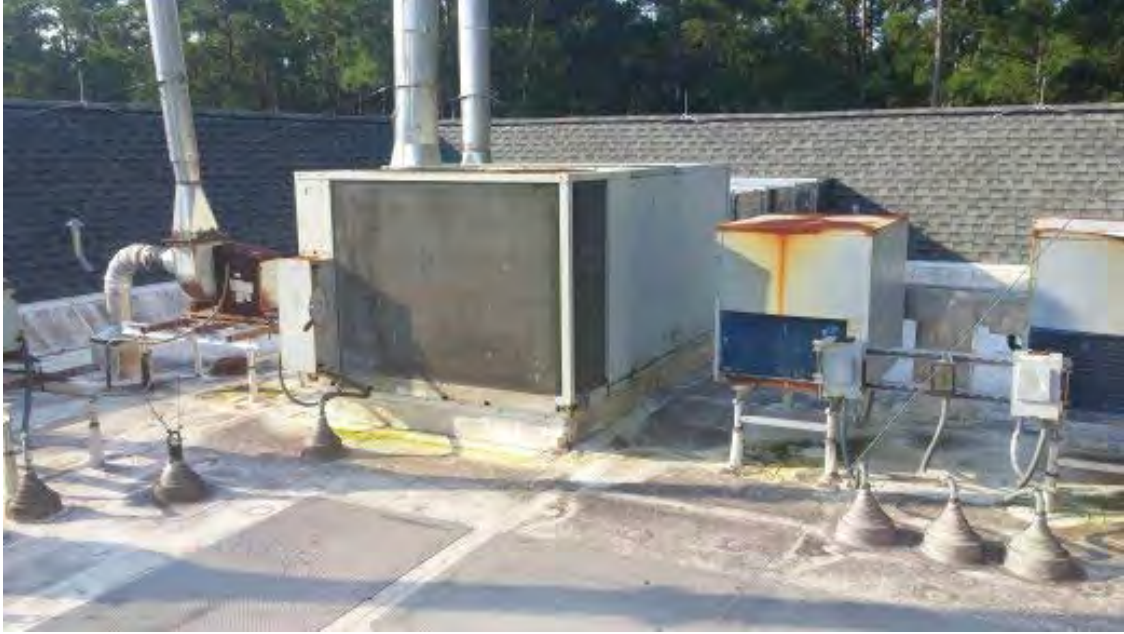
Existing 15 ton to be removed and replaced with new 12 ton HVAC unit