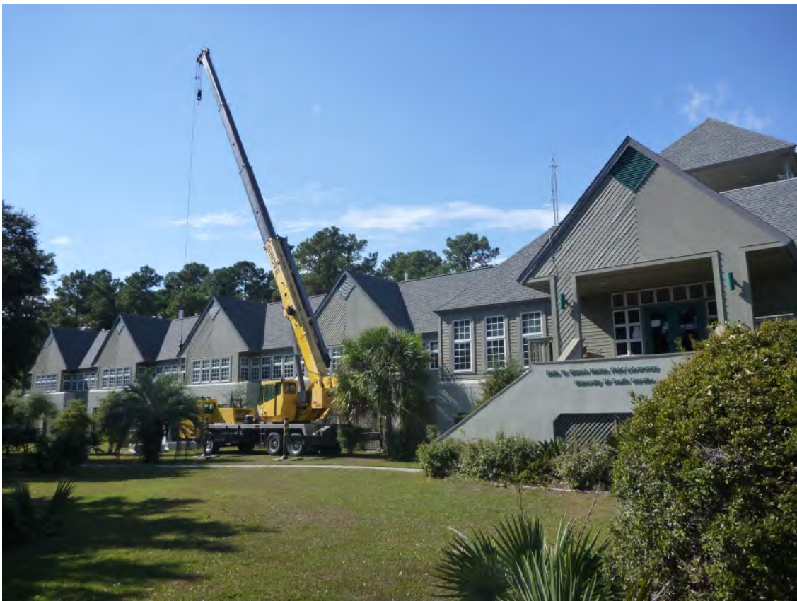
Recent photo showing previous crane removing and replacing adjacent HVAC Unit