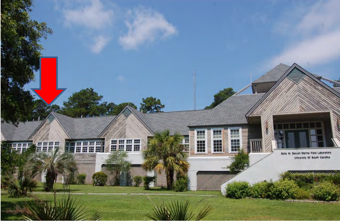
FRONT VIEW OF MARINE RESEARCH FACILITY. RED ARROW SHOWS HVAC LOCATION