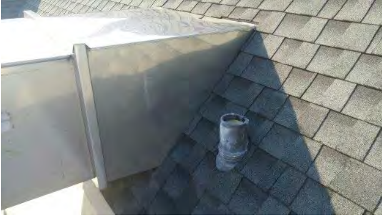
Roof penetration to be closed and roofed over to match existing