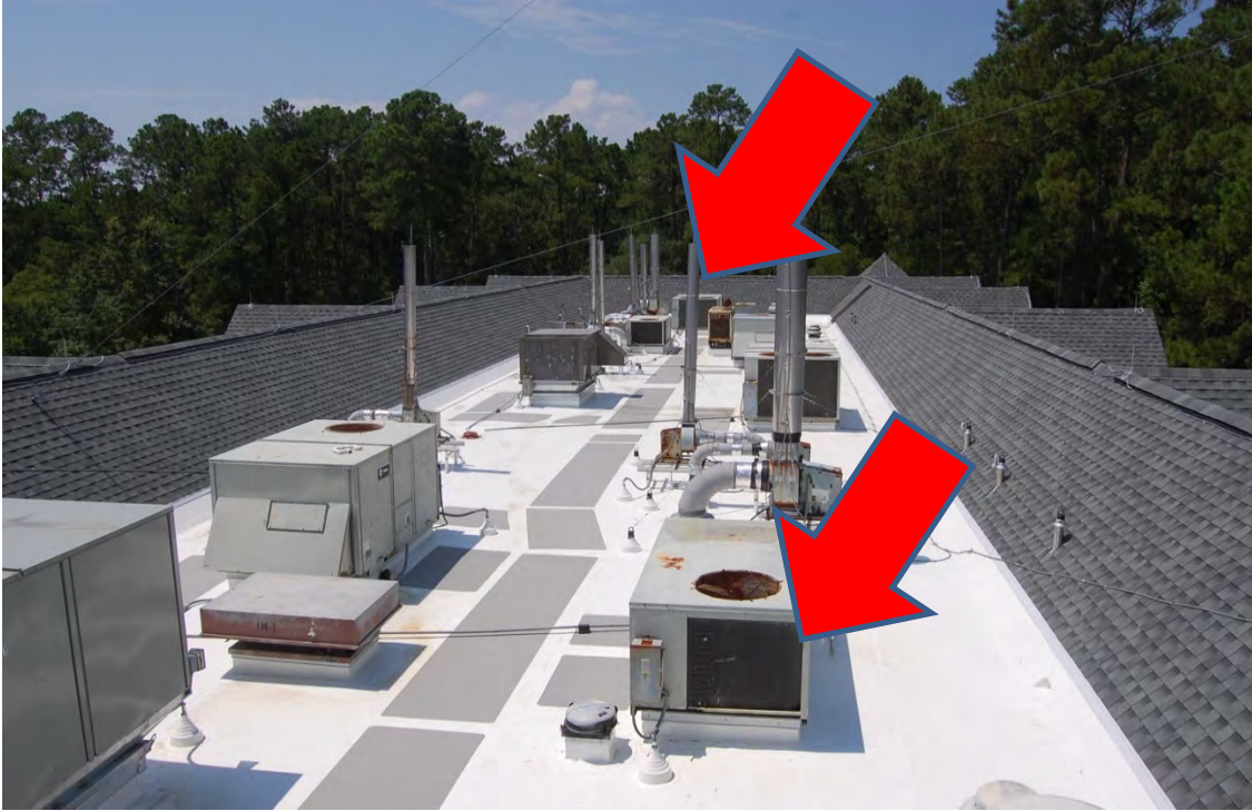
VIEW OF MECHANICAL WELL ON ROOF. RED ARROWS SHOW AC-1 AND AC-2 HVAC LOCATION