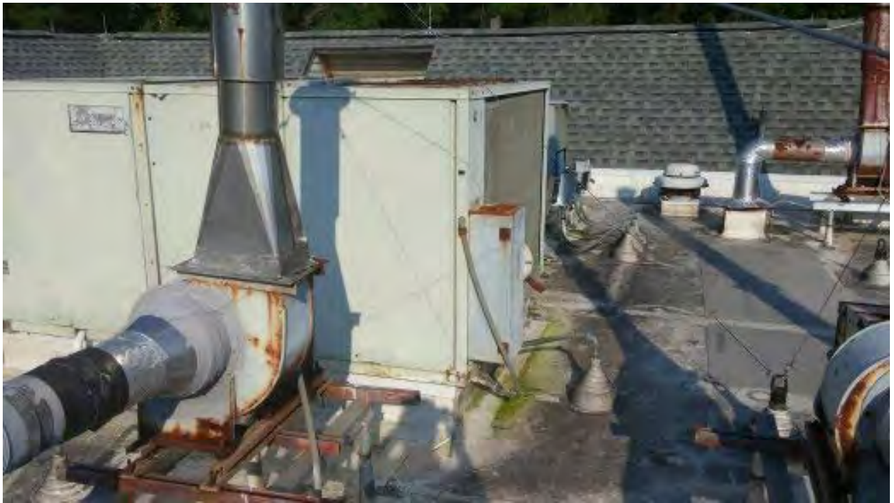
Location of existing electrical power riser thru roof and HVAC unit disconnect switch