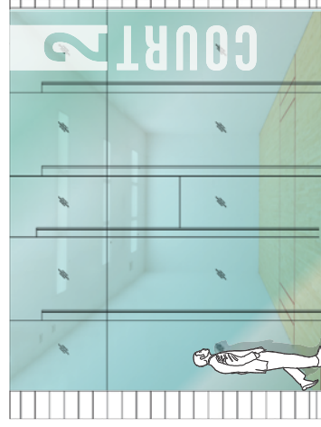
2 M.2 Racquetball ID - Front Elevation SCALE: 1/8" = 1'