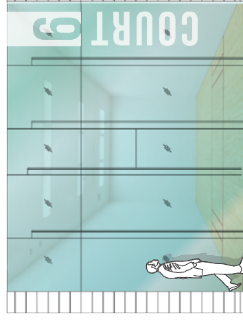
6 M.6 Racquetball ID - Front Elevation SCALE: 1/8" = 1'