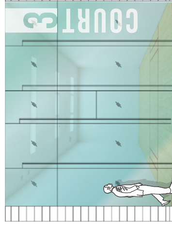
3 M.3 Racquetball ID - Front Elevation SCALE: 1/8" = 1'