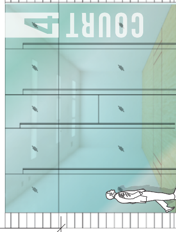
4 M.4 Racquetball ID - Front Elevation SCALE: 1/8" = 1'