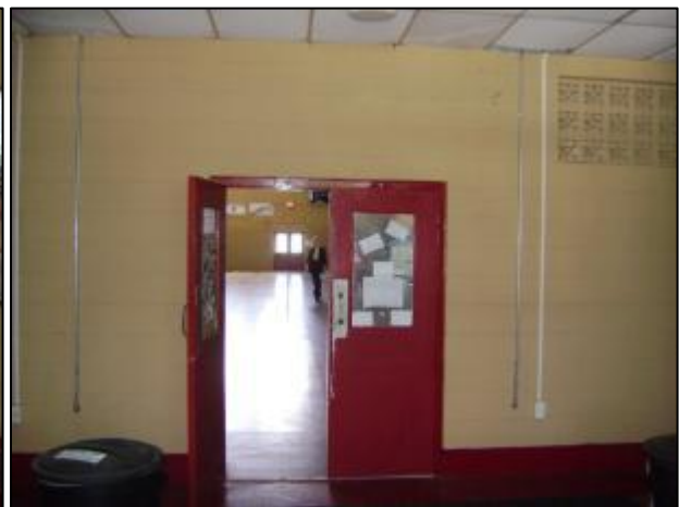
View from Entry 1 looking into gym