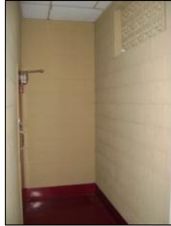
View into Men's Restroom Entrance