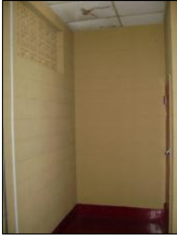
Interior View into Women's Restroom Entrance