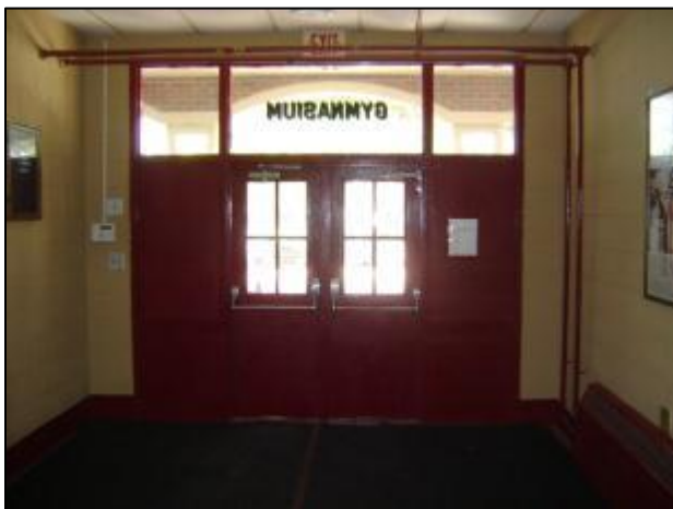
View of Entry 1