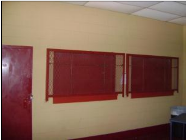
View of concession stand