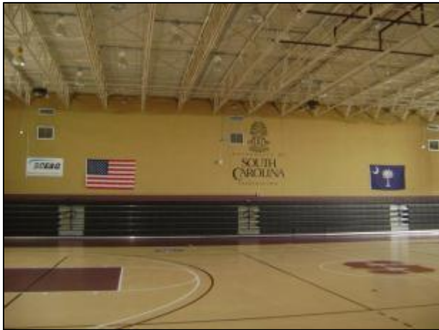
West Wall of Gym