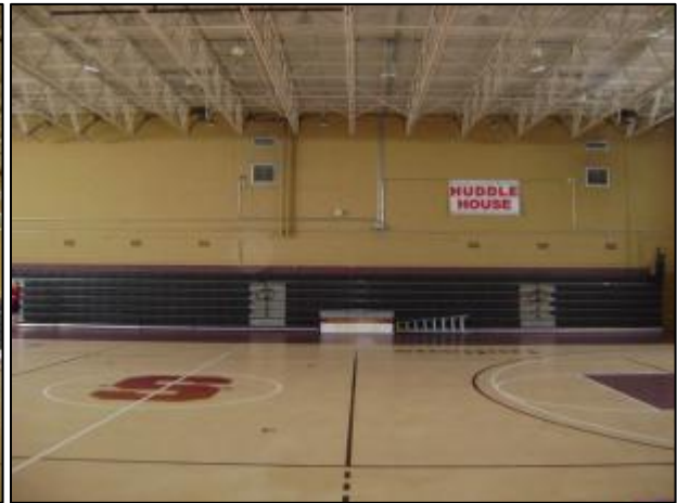
East Wall of Gym