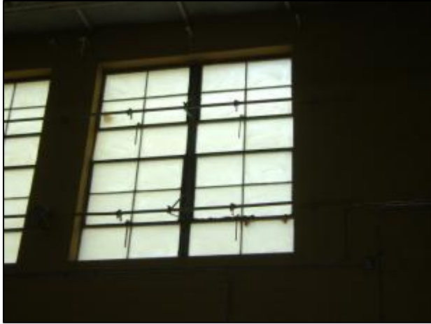
View curtain rods