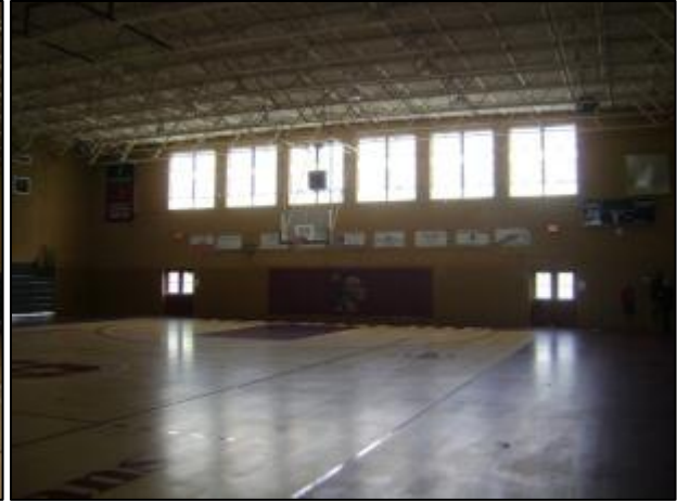
North Wall of Gym