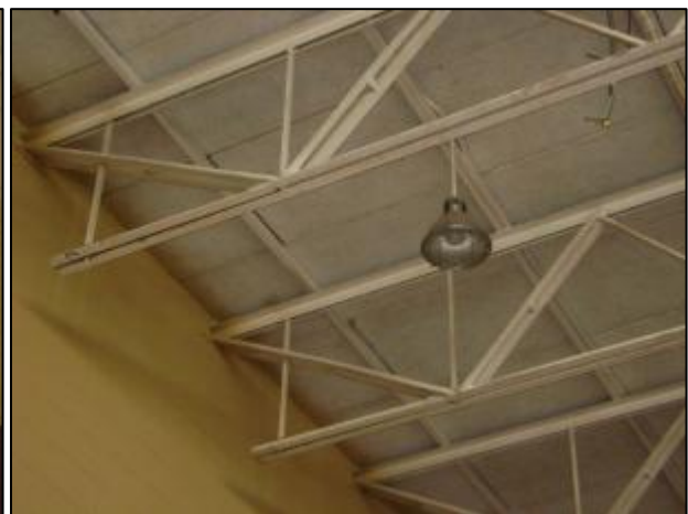
View of roof joists