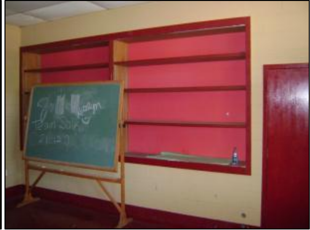
View of trophy case