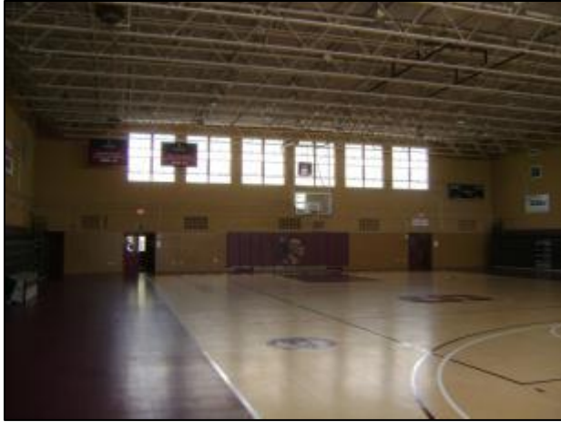
South Wall of Gym