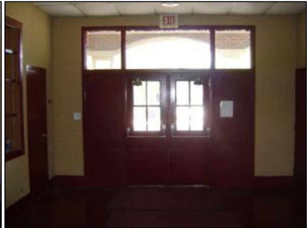
View of Entry 2