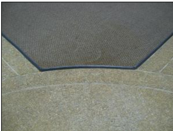
View of Arch in Carpet