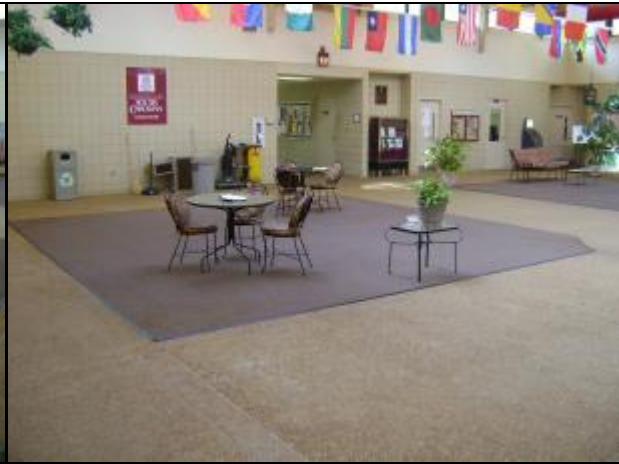
View of 21 ft. x 21 ft. Square of Carpet