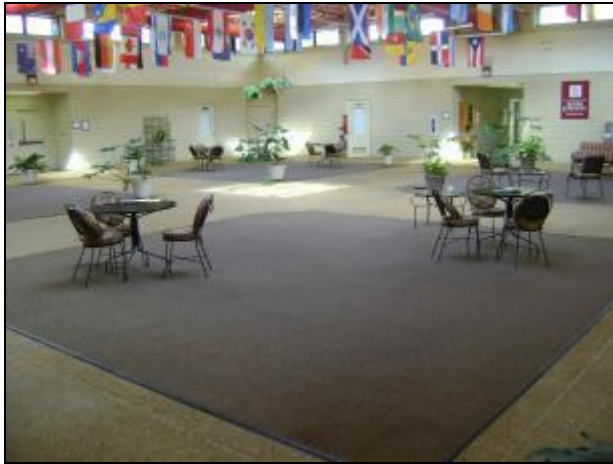
View of (4) 21 ft. x 21 ft. Squares of Carpet

Any interested vendor that would like to preview the work site prior to submitting a quote may contact Fran Smith at (803) 584-3446, ext 2312 or fsmith@mailbox.sc.edu to schedule it prior to deadline for receipt of quotes.