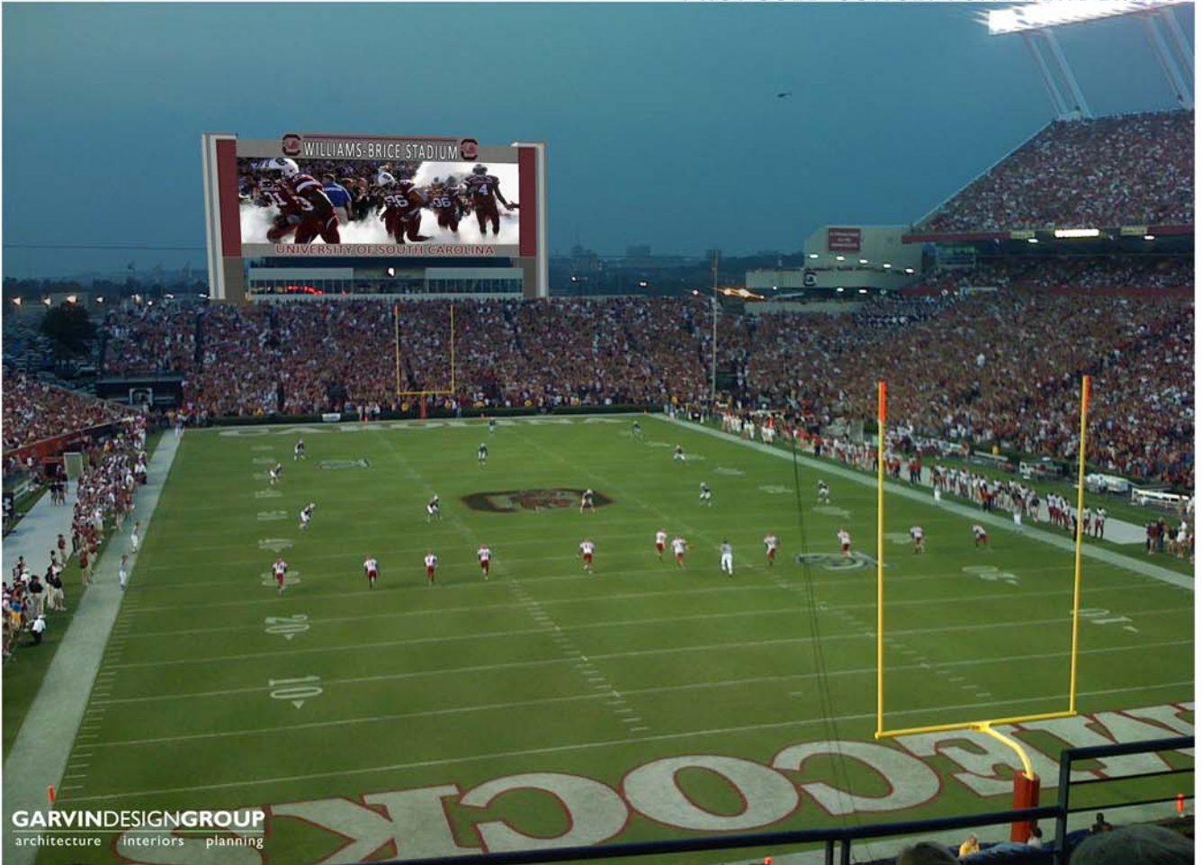
PROPOSED CONCEPTUAL RENDERING