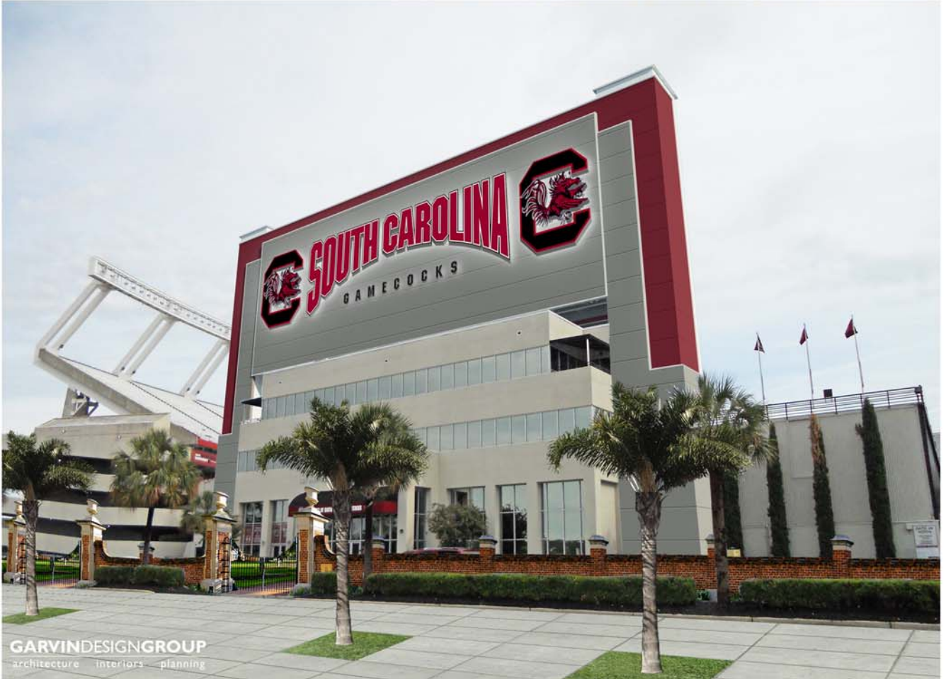
PROPOSED CONCEPTUAL RENDERING