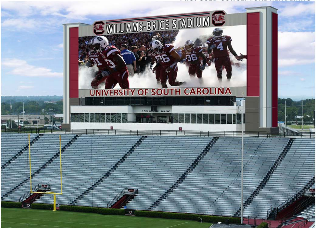
PROPOSED CONCEPTUAL RENDERING