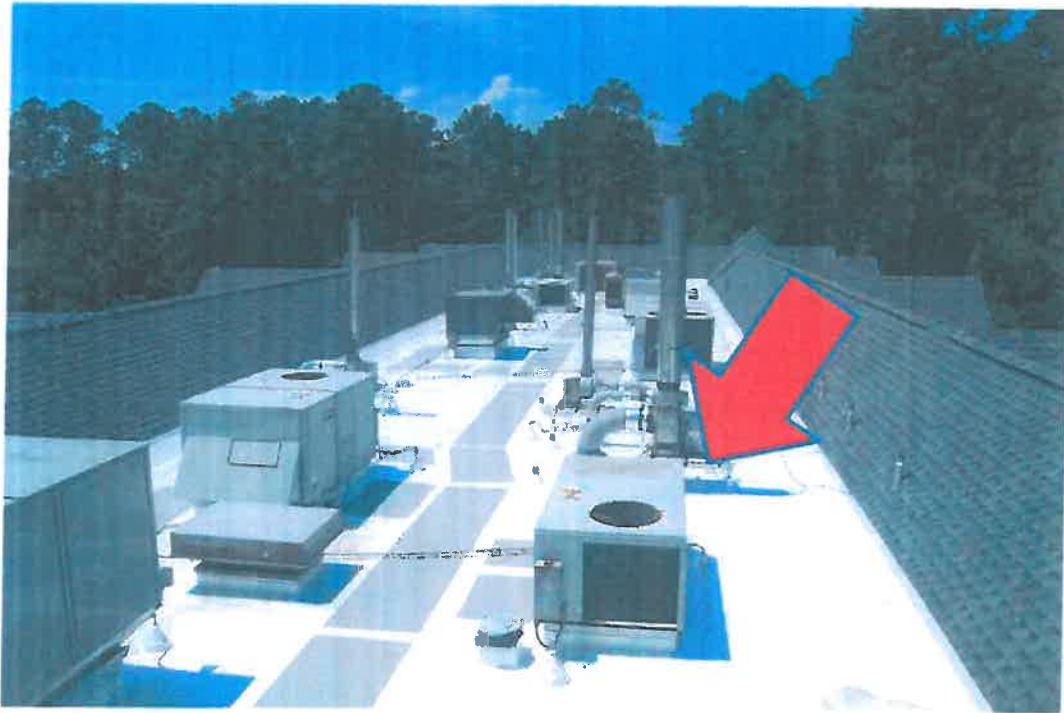
OVER HEAD VIEW OF MECHANICAL WELL ON ROOF. RED ARROW SHOWS HVAC LOCATION