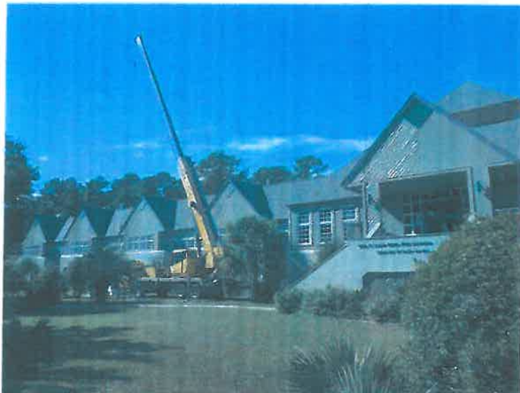
Recent Photo Showing Crane removing and replacing adjacent 10 ton HVAC Unit