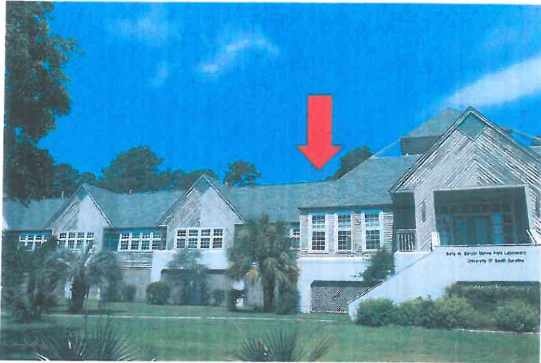
FRONT VIEW OF MARINE RESEARCH FACILITY. RED ARROW SHOWS HVAC LOCATION