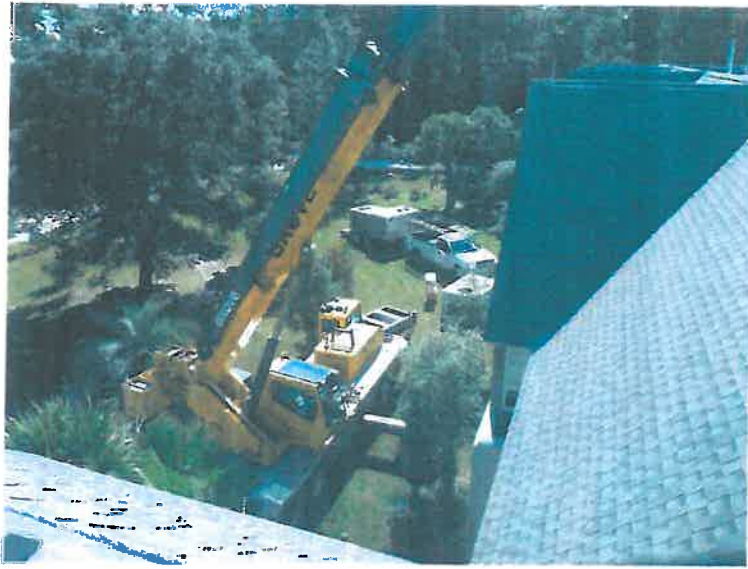
Recent Photo Showing Crane removing and replacing adjacent 10 ton HVAC Unit