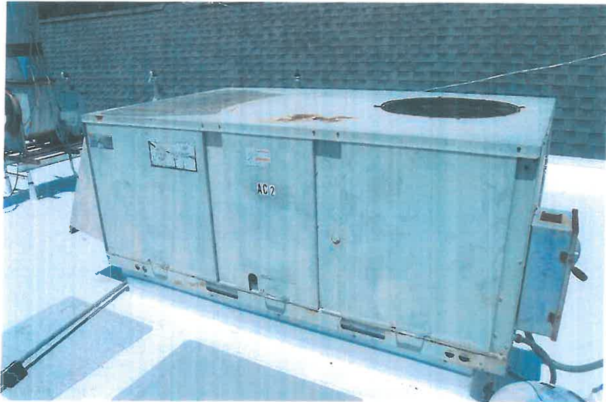
Existing 7.5 ton to be removed and replaced with new 10 ton HVAC unit