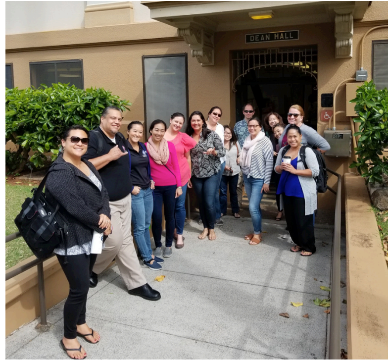
CC Counselor Visit with College of Social Sciences