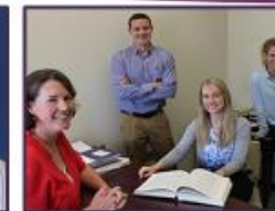
• Human Development Faculty