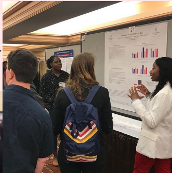
Discover USC 2019, Columbia, SC