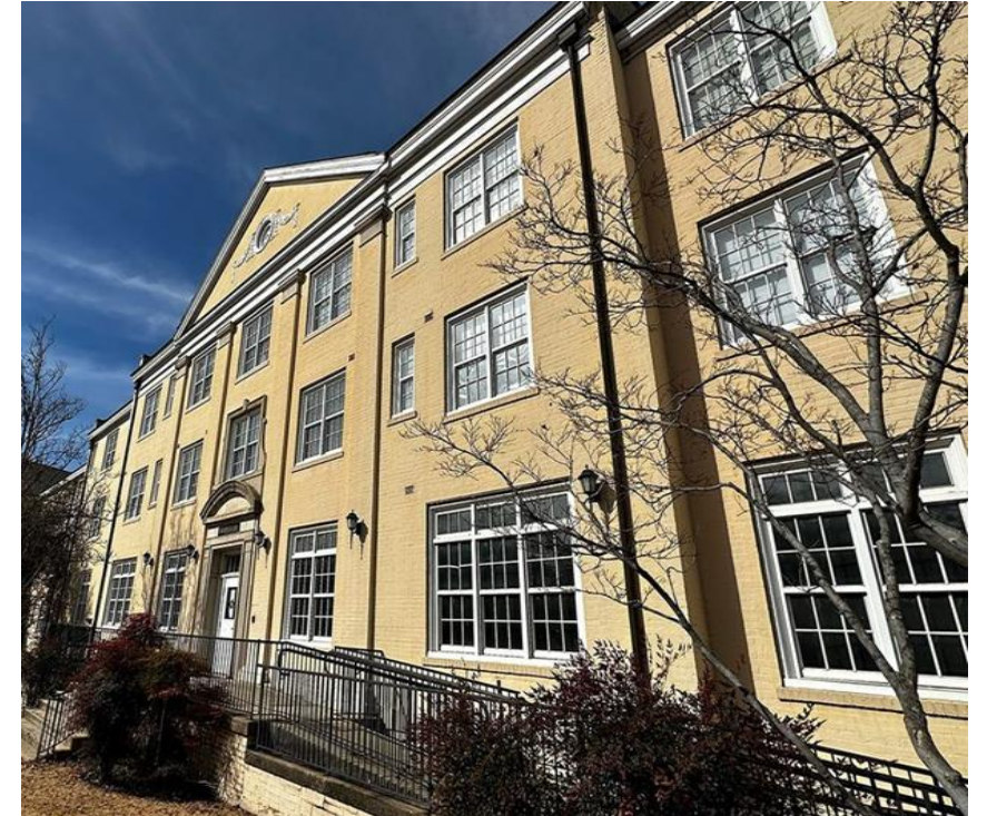
Maxcy College 1332 Pendleton Street