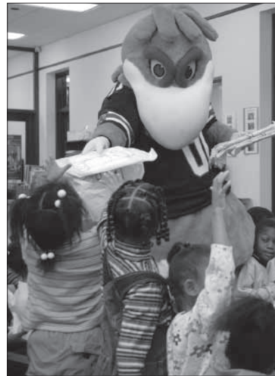
Cocky hands out free books to schoolchildren.