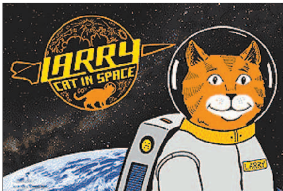
See Larry Cat at Aiken's Ruth Patrick Science Education Center.