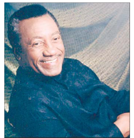
South Carolina native Maurice Williams