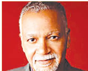
Jazz pianist Joe Sample