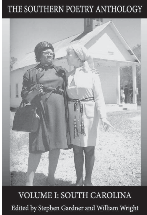
The anthology contains poems by 76 South Carolina poets.

Poets with connections to the Columbia campus in the anthology are Kwame Dawes, a professor of English;