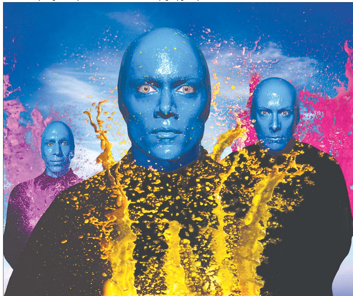
Blue Man Group brings its family-oriented entertainment and always-goopy grease paint to the Colonial Center March 6.