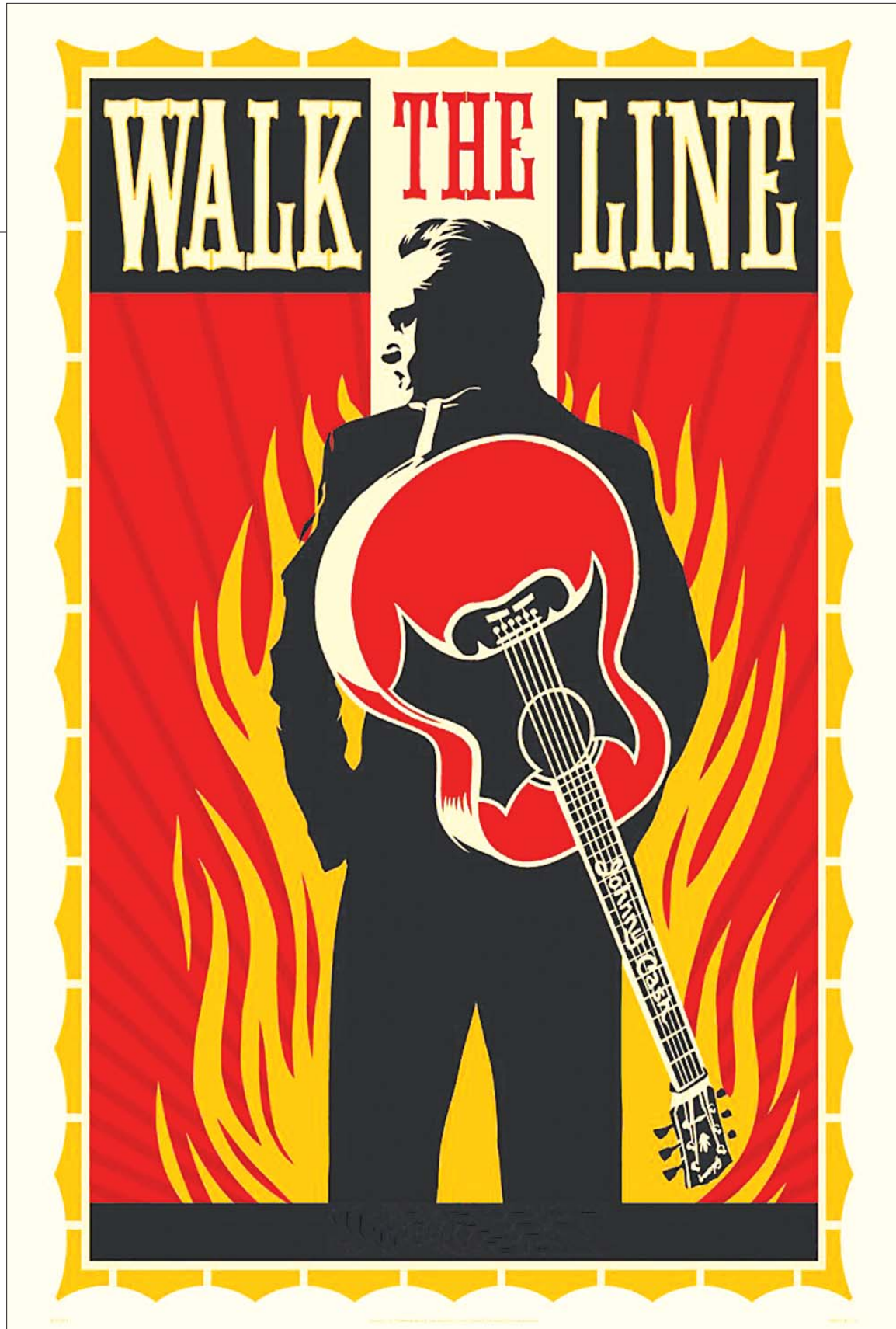
The Johnny Cash biopic Walk the Line plays at the Russell House Oct. 26–29.