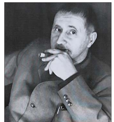
Playwright Bertolt Brecht