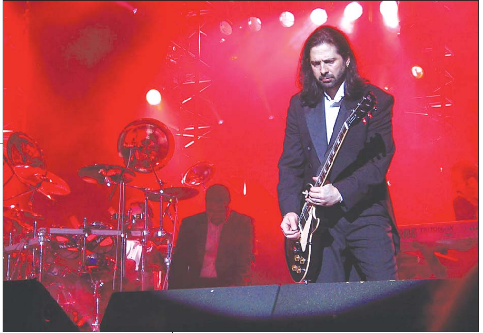
The Trans-Siberian Orchestra, right, performs at the Colonial Center Dec. 13.