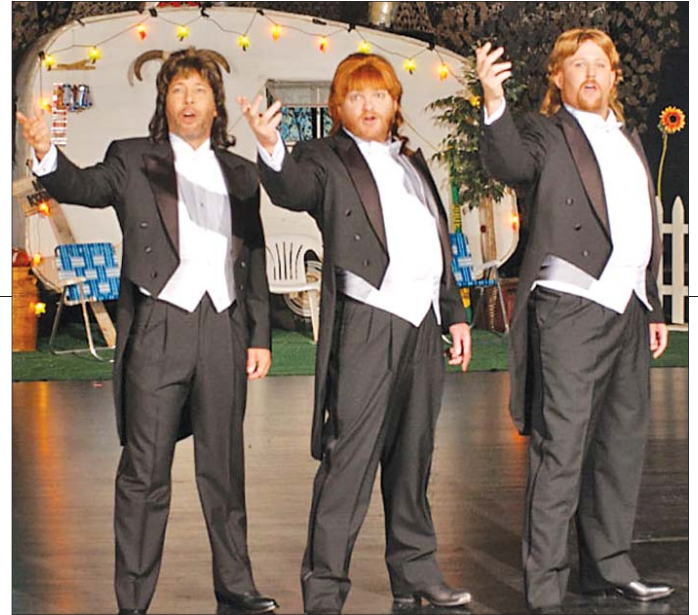
The 3 Redneck Tenors, above, perform at USC Aiken Nov. 20. The Dirty Dozen Brass Band, below, brings its show to Aiken Nov. 17.

Nov. 17 USC Aiken: Dirty Dozen Brass Band, 8 p.m., Etherredge Center. For more information, call 56-3305.