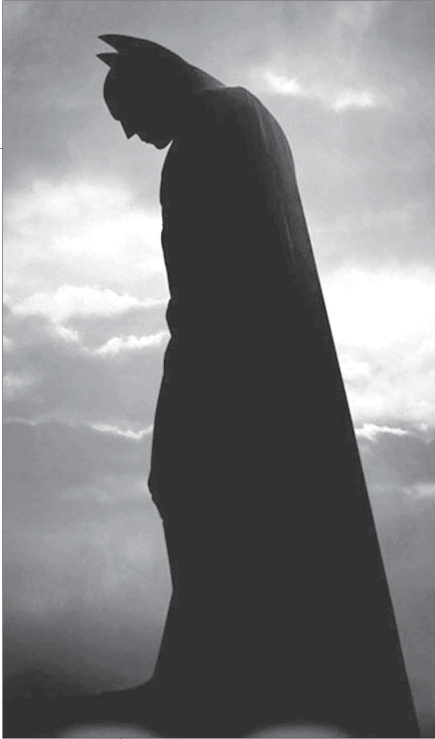
Batman Begins opens at the Russell House April 7.