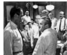
A scene from Twelve Angry Men .