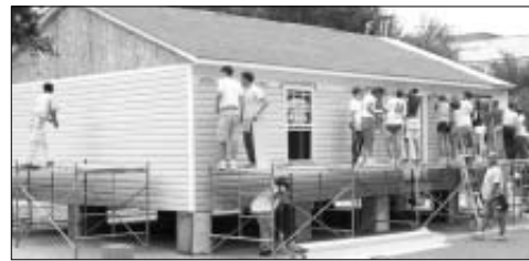
Students volunteered their time and construction skills to build a house for Habitat for Humanity.