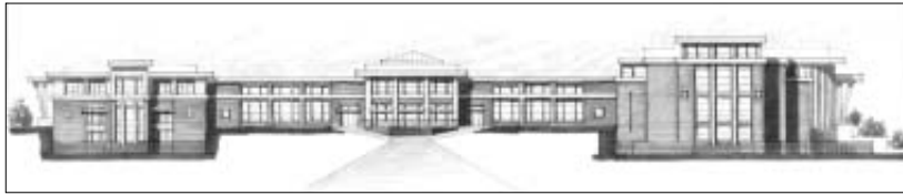
Upstate's Health Education Complex will house the campus' nursing and education schools, enrollment services, and a fitness center with a jogging track, lap pool, and climbing wall.

For a list of anniversary activities, go to www.sph.sc.edu .