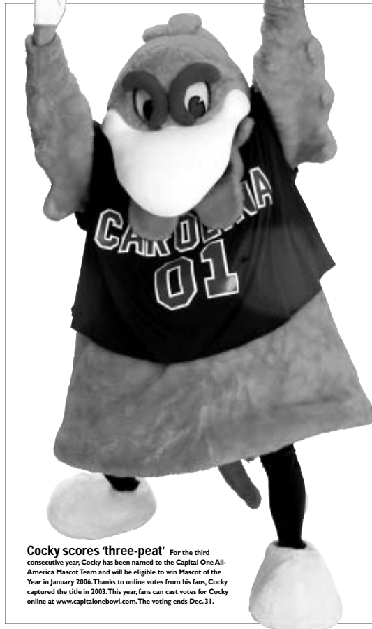
Cocky scores 'three-peat' For the third consecutive year, Cocky has been named to the Capital One All-America Mascot Team and will be eligible to win Mascot of the Year in January 2006. Thanks to online votes from his fans, Cocky captured the title in 2003. This year, fans can cast votes for Cocky online at www.capitalonebow.com . The voting ends Dec. 31.