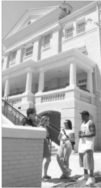
USC's West Quad boasts the latest technology and environmental features for conserving water and energy and creating a healthier, greener environment for students.