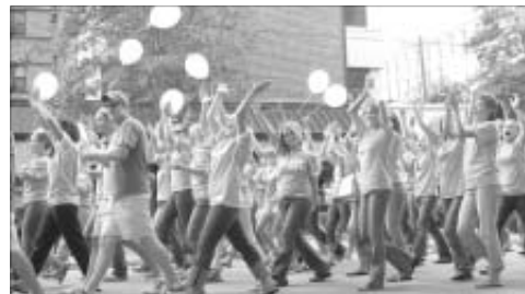
Greek fraternities and sororities cheer on the Gamecocks during the annual Homecoming parade.