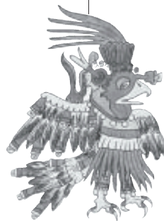
Antiquities of Mexico, Kingsborough

Of special note in the final case is a copy of the Mexican military code of justice owned by General Santa Anna.