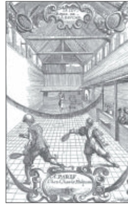
The earliest book written about tennis, from the Haggard Collection, is in a new exhibit at Thomas Cooper Library.