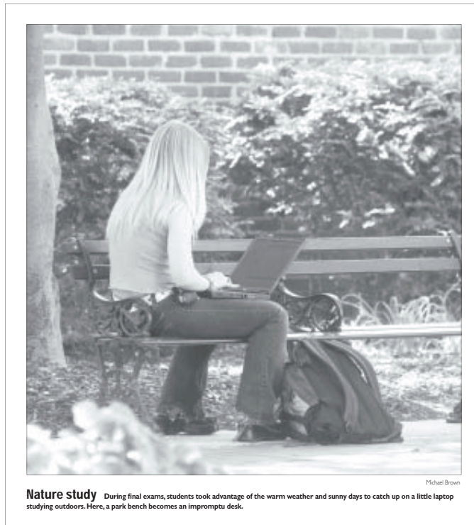
Nature study During final exams, students took advantage of the warm weather and sunny days to catch up on a little laptop studying outdoors. Here, a park bench becomes an impromptu desk.