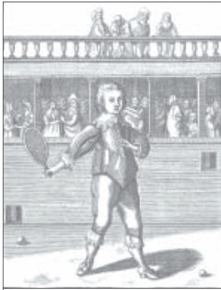
Exhibit traces evolution of tennis