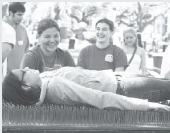
The bed of nails, sponsored by the Department of Physics and Astronomy, is a popular attraction at USC Showcase. This year's annual open house also will include walking tours, festival foods, and exhibits.

CONFERENCE: The Southeast Association for Book Arts will hold a conference May 19-21 at USC. "Artists' Books: Weaving Concepts and Materials" will include speakers, workshops conducted by book artists, and a book art sale. For more information, go to www.cas.sc.edu/art/SABA/index.html .