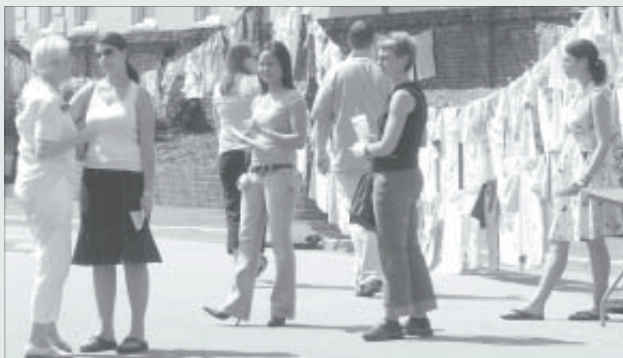
Clothesline Project T-shirts expressing messages of the inner sorrows and triumphs of survivors of interpersonal violence line Greene Street as part of the Clothesline Project. Students, staff, and faculty painted the T-shirts for themselves or on behalf of a family member or friend. The Office for Sexual Health and Violence Prevention sponsors the project as part of Women's History Month.