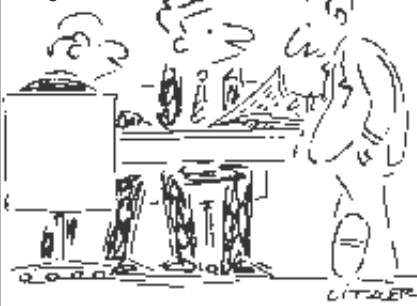
When Robert's Rules of Order isn't clear, consult Miss Manners.