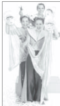
The fairies help make Midsummer special.