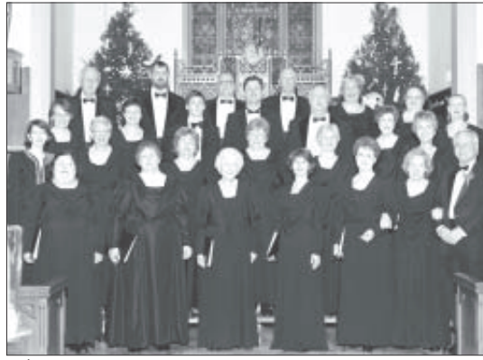
The Árpád Darázs Singers will perform a program of Mozart and other composers at concerts this spring.

Members of the group come from many places, including Virginia, Kansas, New Jersey, Pennsylvania, Indiana, and Germany, as well as South Carolina. The group's membership includes bankers, an electrician, several educators, an attorney, researchers, and computing