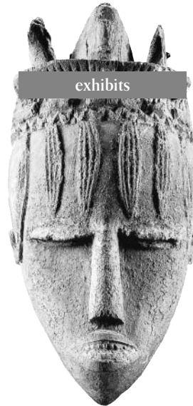
Wooden mask from "Where Gods and Mortals Meet"