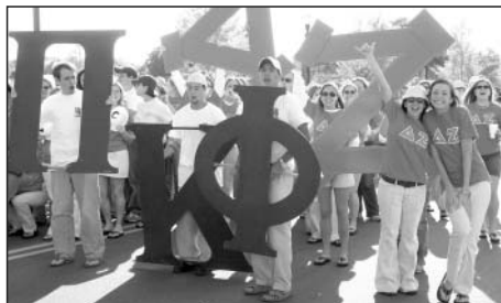
USC's annual Homecoming parade will begin at 4 p.m. Oct. 8.

Cockfest, USC's Homecoming pep rally, is set for 8 p.m.