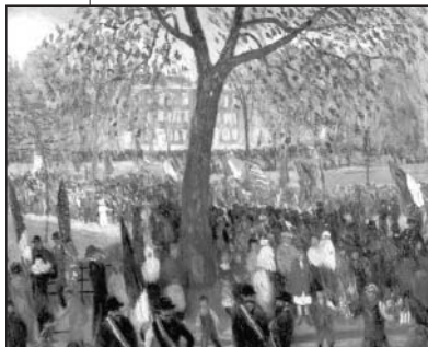
"Parade, Washington Square," 1912, oil on canvas, William J. Glackens (1870-1938)