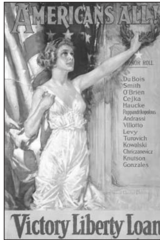
This 1918 American Liberty Loan poster is by Howard Chandler Christy.

McKissick exhibits are free and open to the public. Museum hours are 9 a.m. to 4 p.m. Tuesday, Wednesday, and Friday; 9 a.m. to 7 p.m. Thursday; and 1 to 5 p.m. Sunday. For information, call 7-7251 or access www.cla.sc.edu/MCKS .