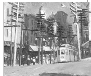
"Yonkers," 1916, oil on canvas, Edward Hopper (1882-1967)