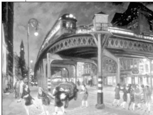
"Sixth Avenue Elevated at Third Street," 1928, oil on canvas, John Sloan (1871-1951)