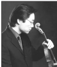
Chinese virtuoso violinist Xui Wei will perform Butterfly Concerto.