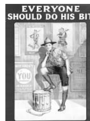
British poster, circa 1915.

■ Through Dec. 7 "Posters of the Great War: An Exhibit from the Joseph M. Brucoli Great War Collection," a collection from the World War I era, representing most of the conflict's combatants, including America, England, France, Italy, and Germany. McKissick Museum exhibitions are free and open to the public. The museum, located on the Horseshoe, is open 9 a.m.-4 p.m. Tuesday, Wednesday, and Friday; 9 a.m.-7 p.m. Thursday; and 1-5 p.m. Sunday. For information, call 7-7251.