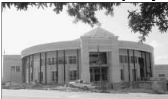
The Strom Thurmond Fitness & Wellness Center will be a state-of-the-art recreational facility.

A. Hours of operation will be approximately 7 a.m.–11 p.m. Monday–Sunday.