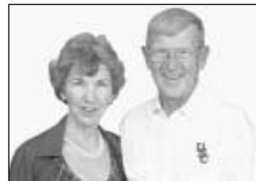
Beth and Lou Holtz