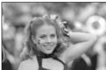
Fired up for football: USC vs. Georgia Sept. 14.