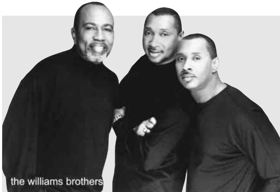
the williams brothers

A publication for USC faculty, staff, and friends JANUARY 17, 2002