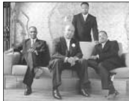
The Canton Spirituals will perform Jan. 20 during USC's MLK tribute.