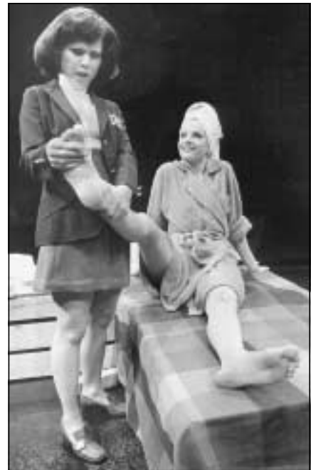
Vanities followed the lives of three women coming of age in the 1960s and '70s.

"Originally, the designers of Longstreet Theater wanted to make it a flexible space, but for reasons of economy they opted for the arena," O'Connor said. "We'd love to realize the original vision. It will mean more varied experiences for our audiences and better training for our student actors and designers."