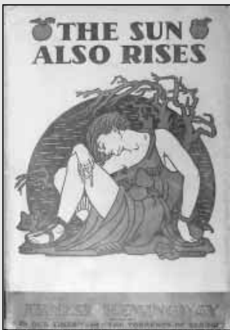
Many collection works have personal inscriptions.

• 4-5:15 p.m.—Session 6: Film: "Hemingway's Spain: Prelude to War," from USC Movietone news archive.