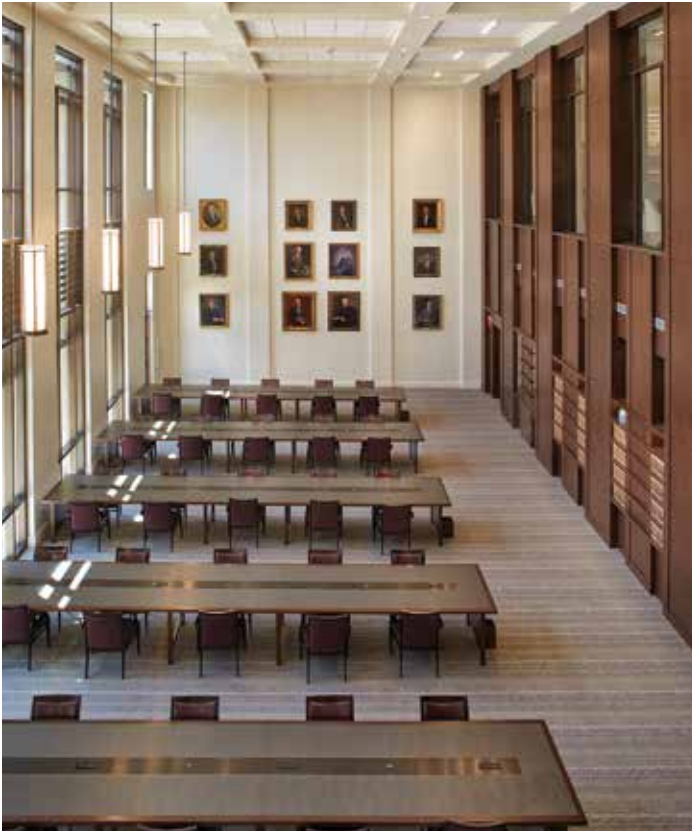
The Coleman Karesh Reading Room is a place for quiet, focused study inside the law library.