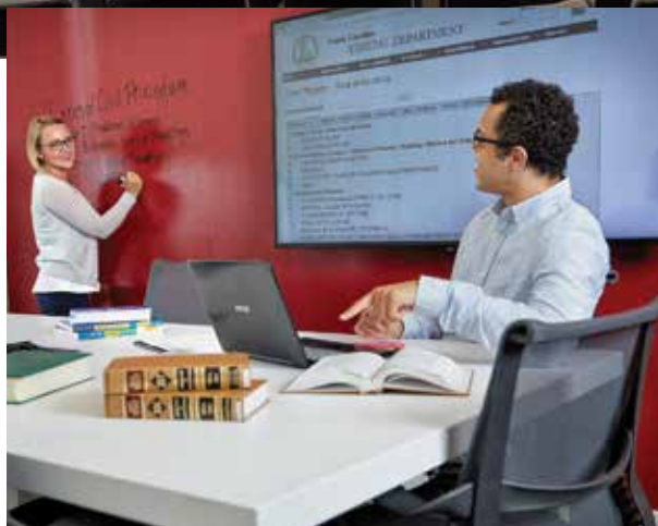
Group study rooms throughout the building are equipped with technology and feature dry-erase walls.