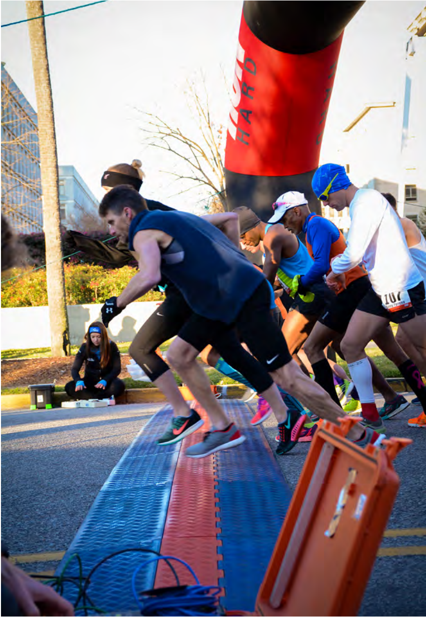
READY, SET, GO. Runners competing in the race hit the street after hearing the crowd of honking cars signifying the start of the race. Runners had stretched and socialized before the race kicked off at 7:30 that morning.

Runners from all over the nation come together on March 4, 2017 to participate in the annual Run Hard Columbia Marathon