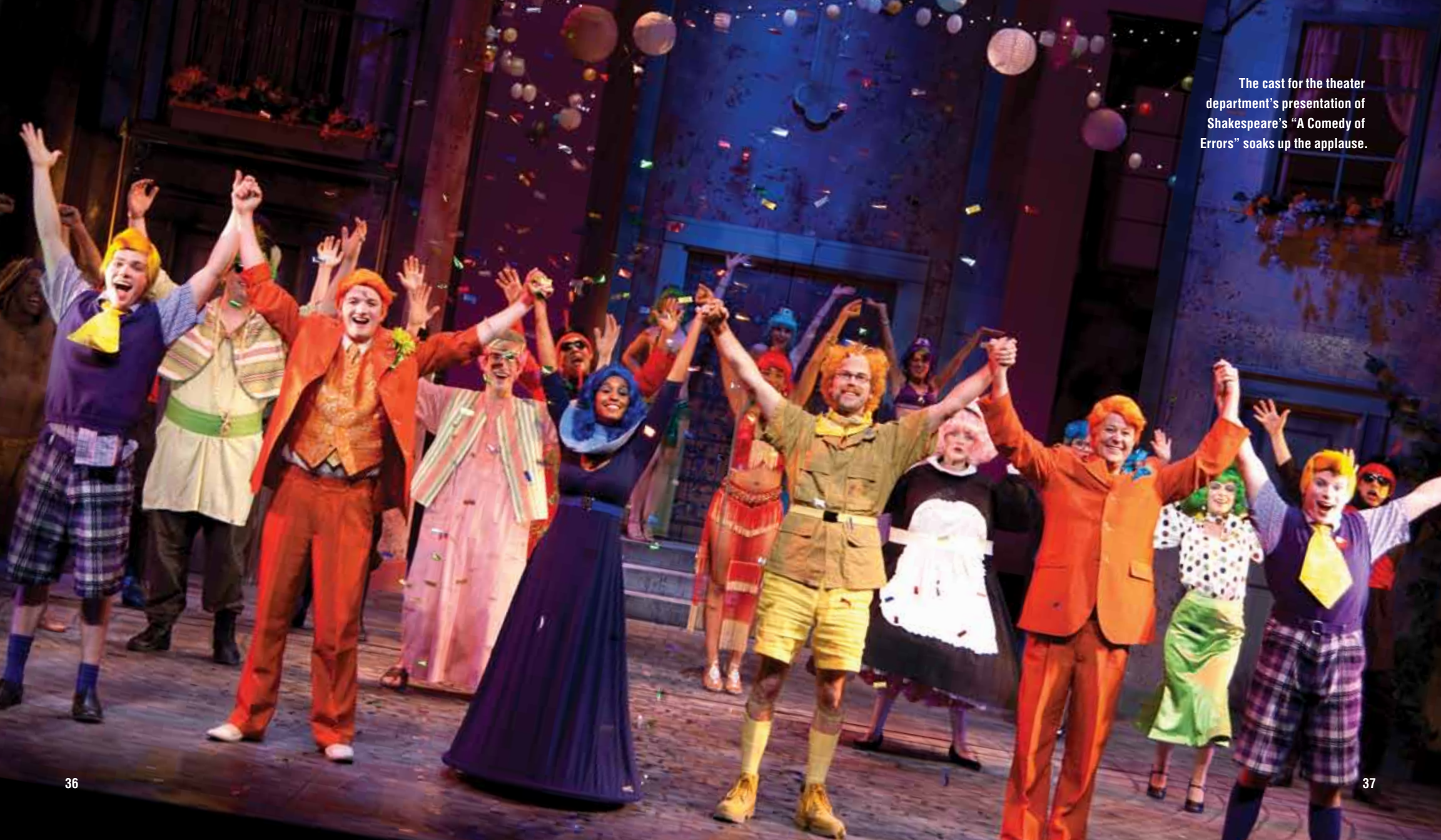
The cast for the theater department's presentation of Shakespeare's "A Comedy of Errors" soaks up the applause.