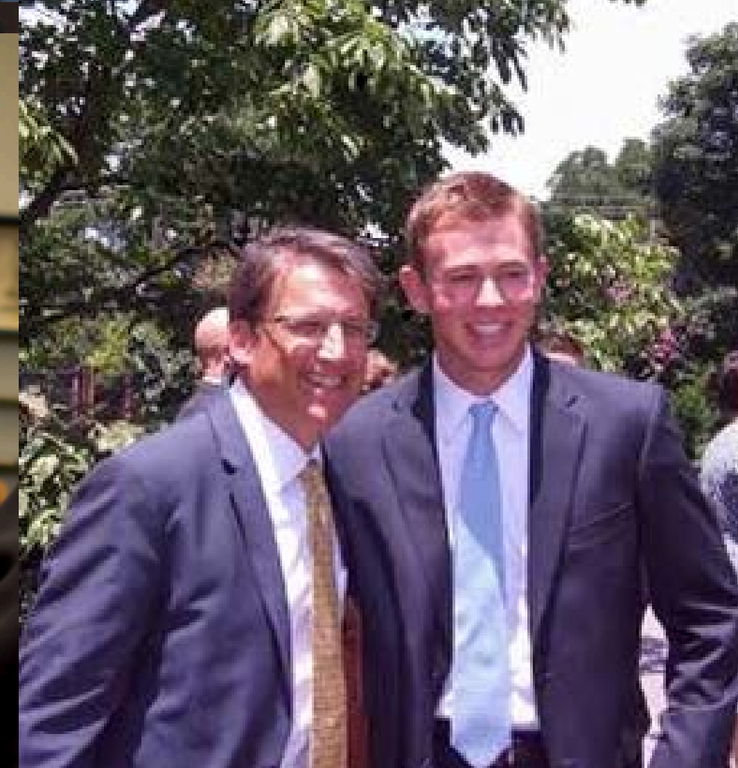
Professional and Civic Engagement